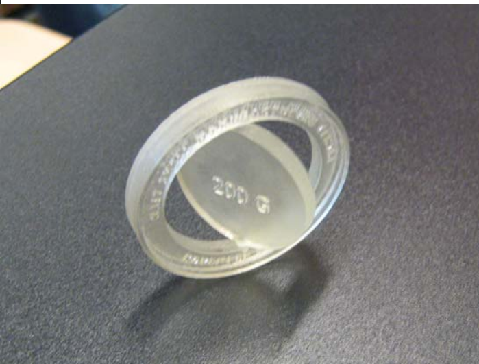
A spinner produced from a rapid prototype machine.