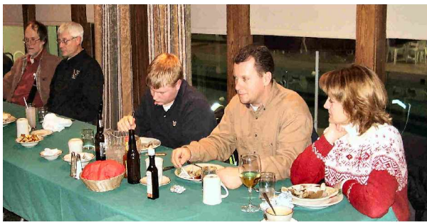
More attendees relaxing and enjoying their dinner just before the presentation