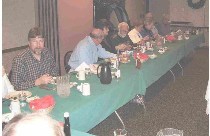
Some of the attendees enjoying dinner.